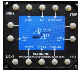
Optional Upgrade Control Module Color (4.75W x 4.3H x 2D) Improved night time visibility with LED lights

Our HWH Systems Control Module is RVIA "RV-C" (CAN) compliant and allows for control of multiple systems on your RV including, suspension systems, leveling systems (air & hydraulic), slide-out systems (room and generator), awnings, generators, automatic steps, energy management systems and much more.