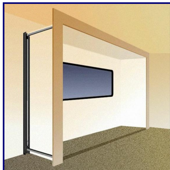
Interior view of room.