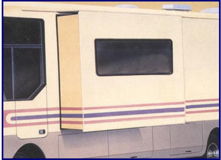
Exterior of room and coach.